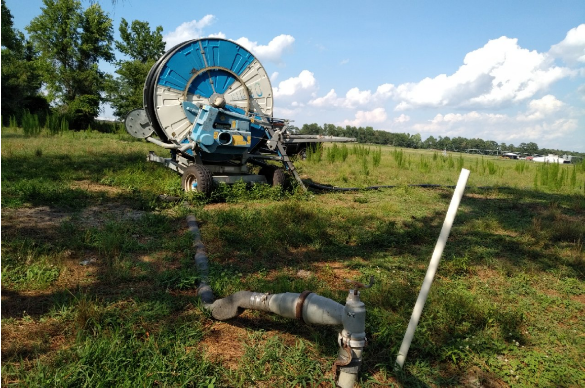
Ocmis Reel #2