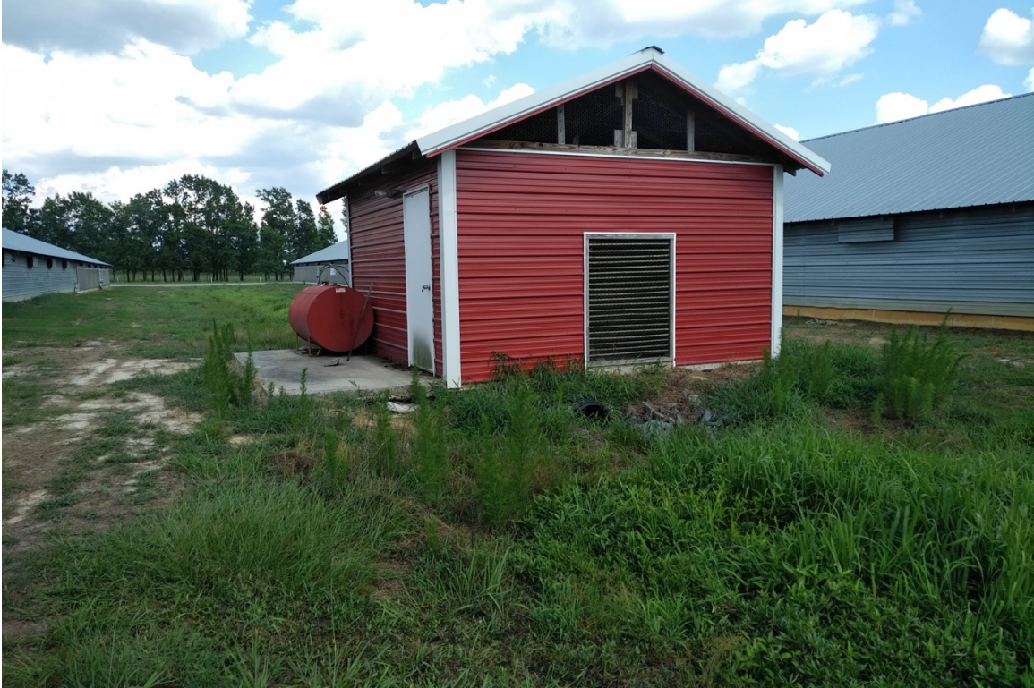
Shed / Pumphouse