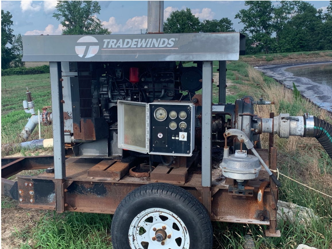
Irrigation Pump #2.