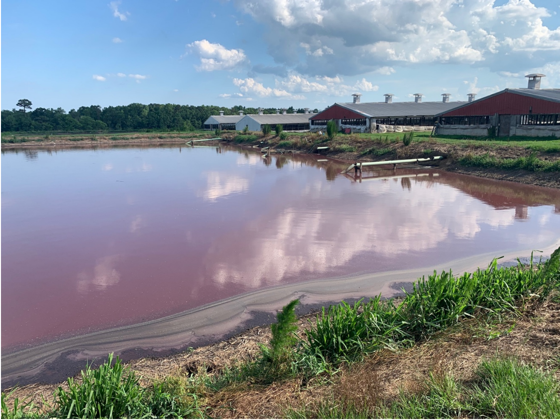
Unit 2 Lagoon.