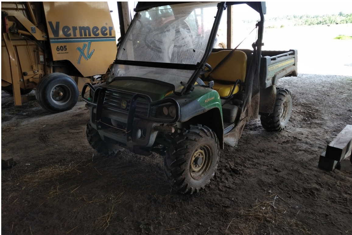
You can always use a John Deere Gator!