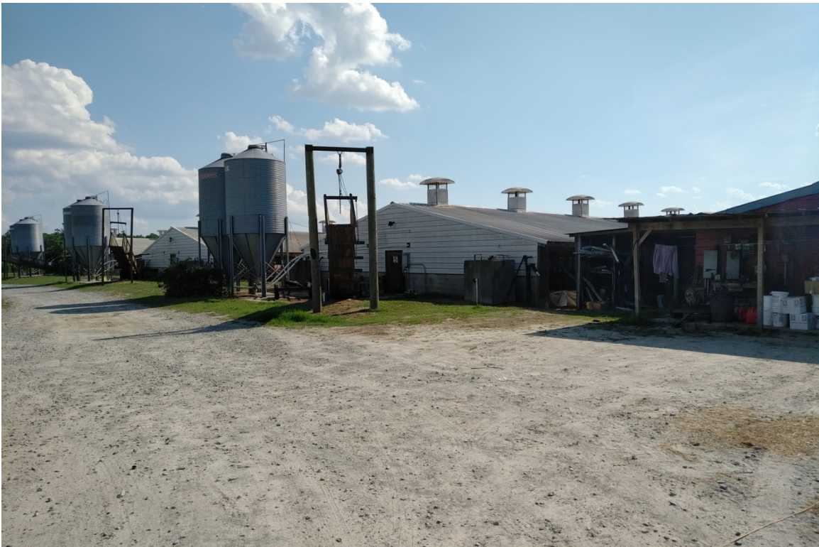
Swine Farm Unit 1 view with Shop