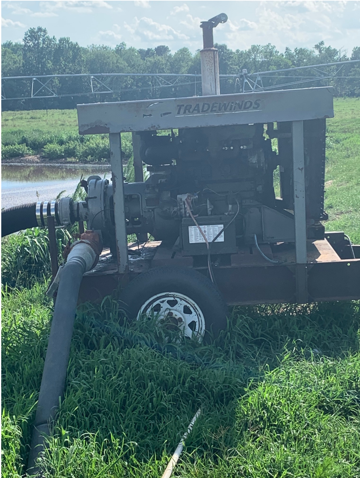
Irrigation Pump #1.