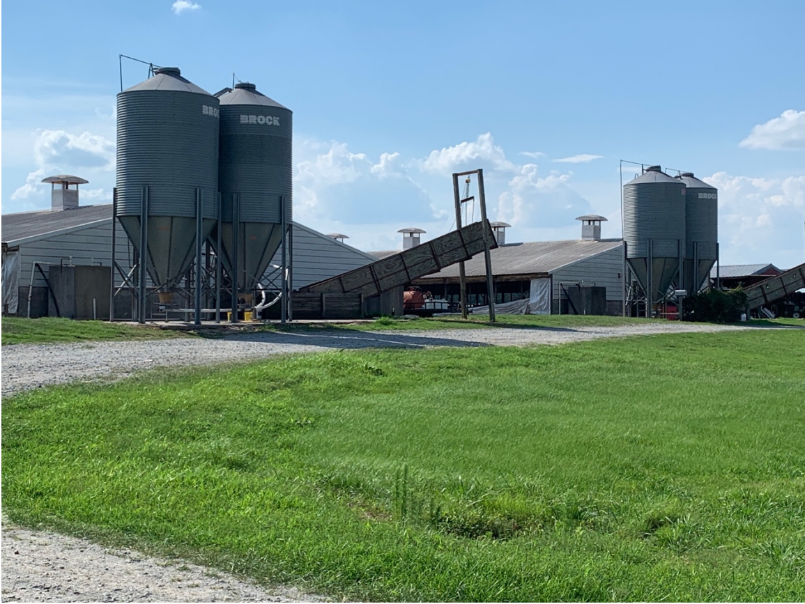
Swine Farm Front Side. Unit 1.