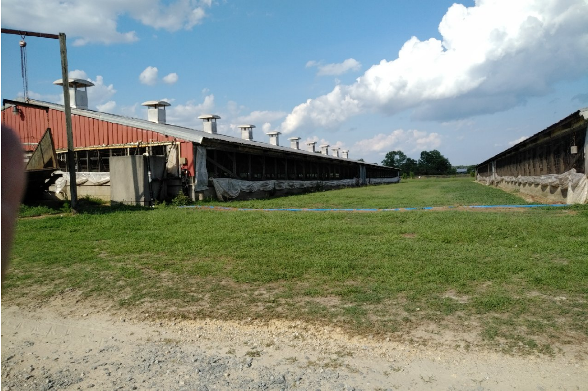
1244 Feeder to Finish Buildings.