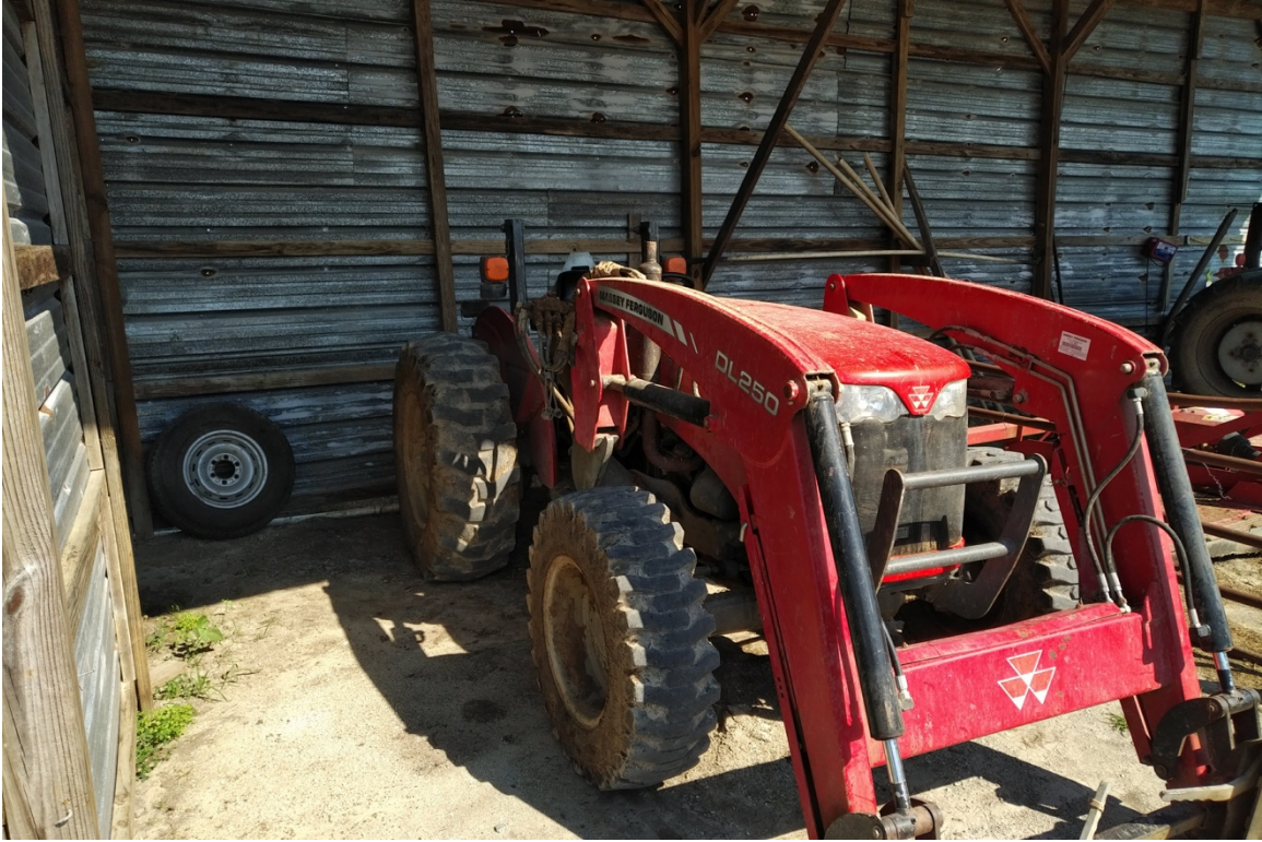
2615 Massey Ferguson Tractor