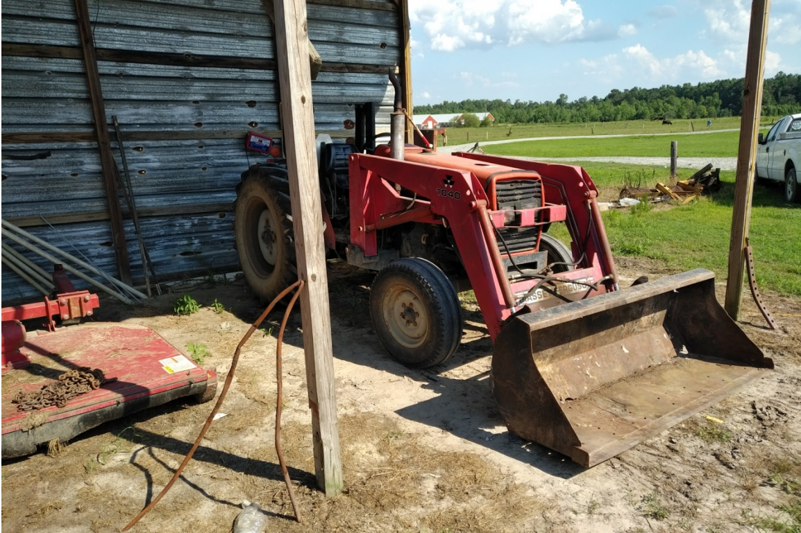
Massey Ferguson Tractor #3