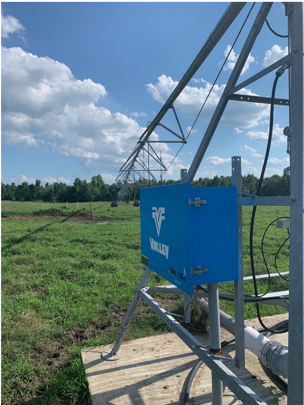
Center Pivot. "Makes pumping so much easier!"