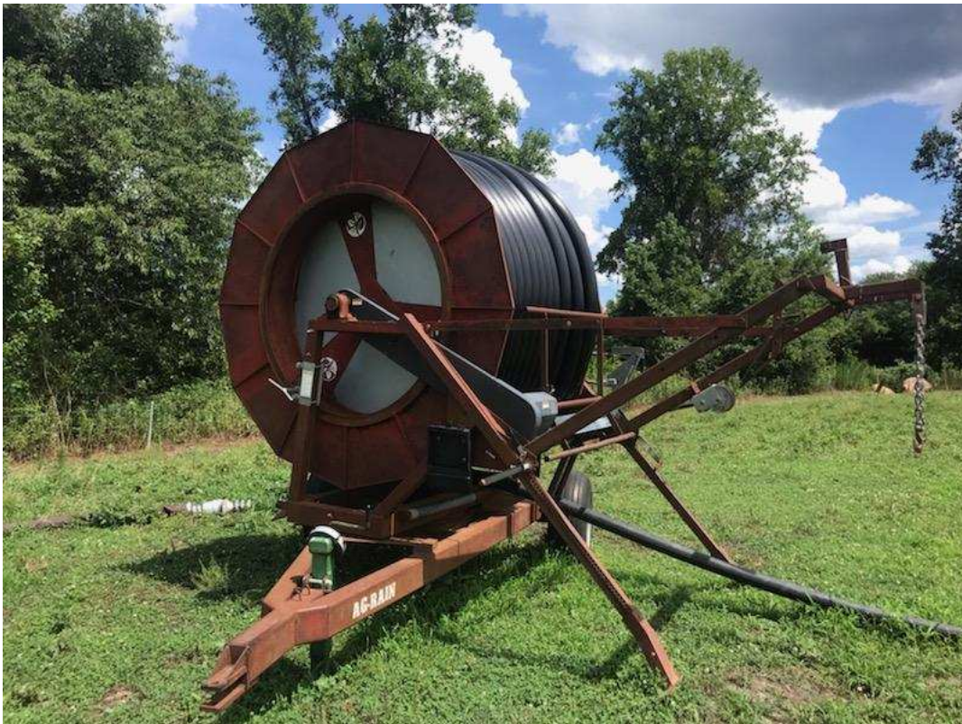
Ag Rain Reel #1