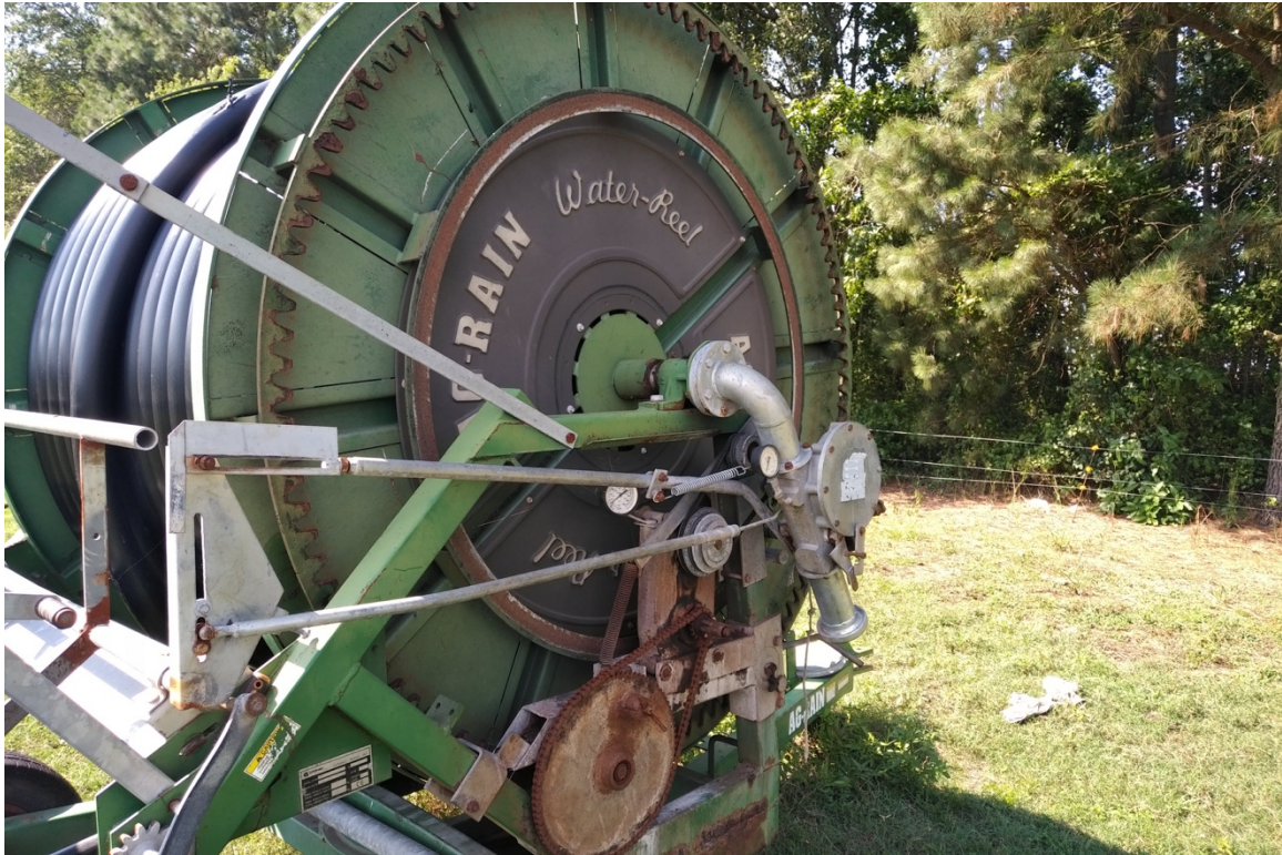
Ag Rain Reel #2