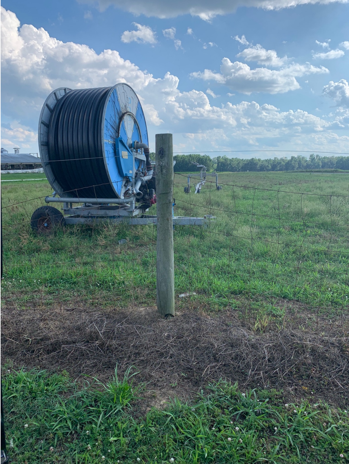
Ocmis Reel #1