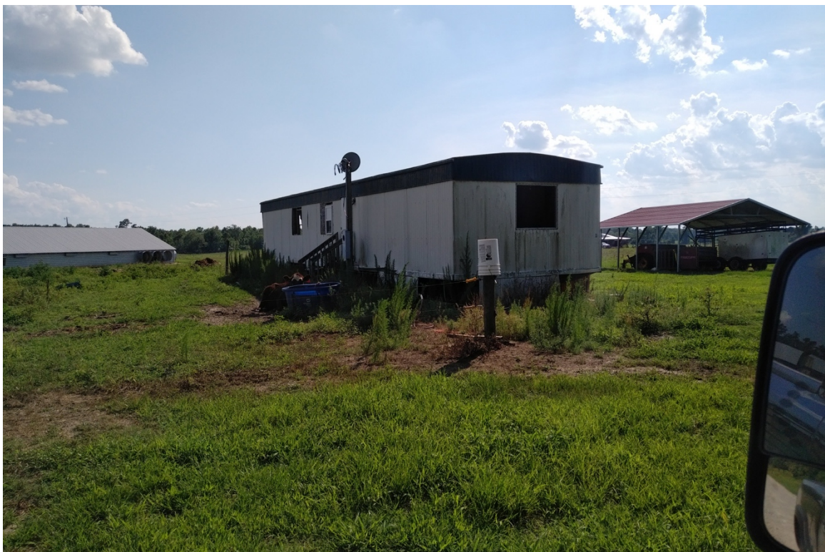
House lot that comes with the farm