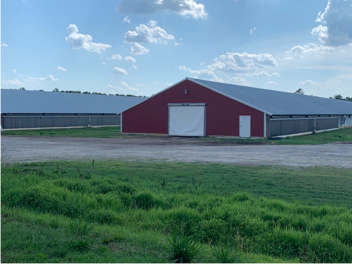
2011-2012 Broiler House Operation