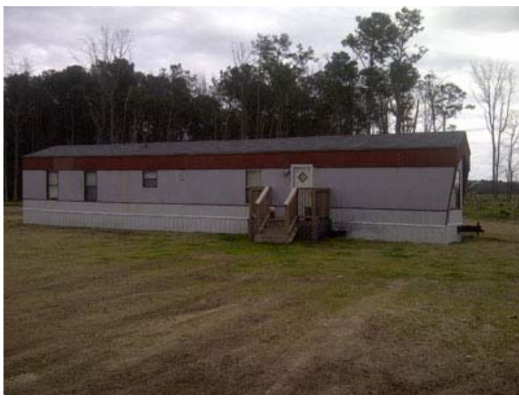
AgrimentServices.Com © 2015 • Privacy Policy • Terms Of Use